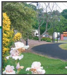
City Park, Lilburn, GA