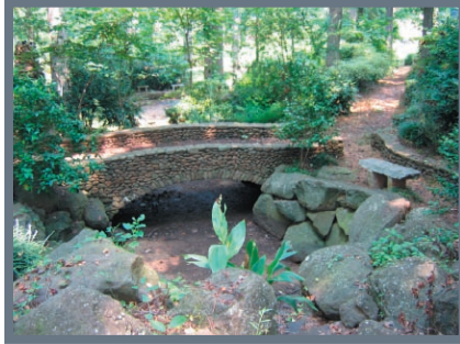
Glen Emerald Park, Decatur, GA

Throughout the 20th century Atlanta and the Southeast have experienced the same growing pains as many other cities across the country. With urban sprawl, businesses and residents have migrated to the fringes of the city and land is rapidly being bought up and developed. As a result, many downtown areas have experienced a significant decline during the last half of the 20th century, with many of our historic places falling prey to the bulldozer.