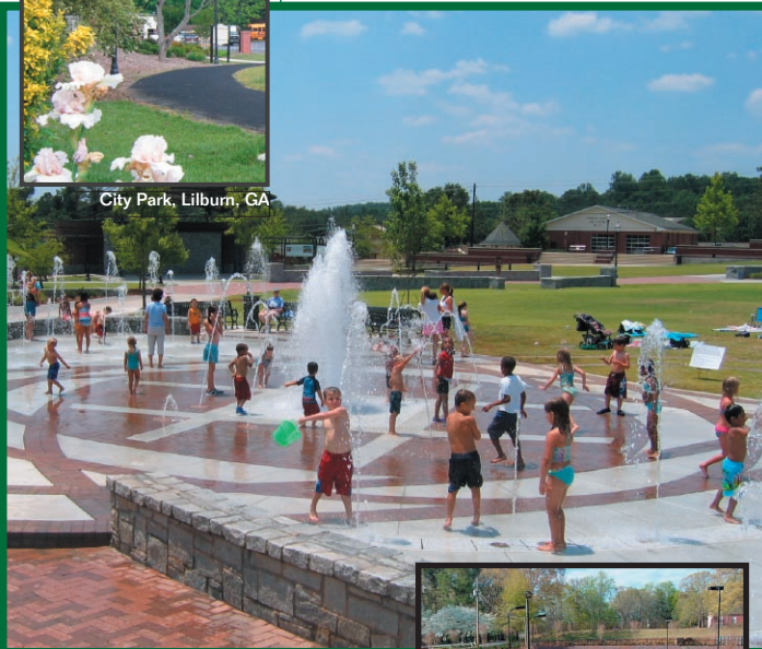
Interactive Fountain, Suwanee, GA