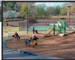
Jamestown Park, College Park, GA