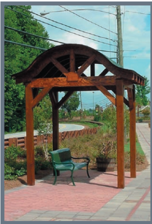
Trolley Line Park, Vinings, GA

Renewed awareness and appreciation of the importance of preserving historic landscapes and reviving urban environments has begun to reverse this trend.