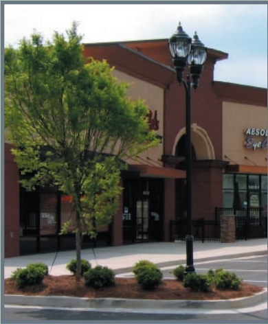
Sharon Road Promenade

Located in Forsyth County, this 40,000 square foot retail center includes three restaurants, two with outdoor dining areas, and a fitness club. jB+a worked with MB Properties to prepare Buffer Variance documentation which includes the integration of sidewalks and a bus stop area along both Peachtree Parkway and Sharon Road frontages. jB+a also prepared tree protection & replacement plans to meet the