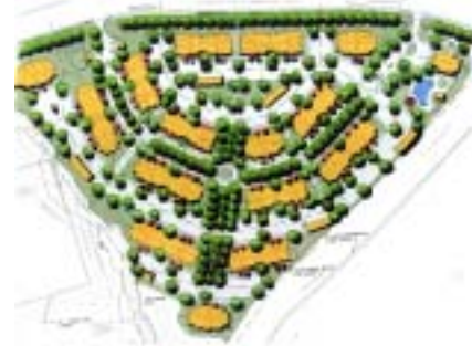
The Fairways at Jennings Mill - Athens, Georgia

jB+a has recently completed work on The Fairways at Jennings Mill in Athens, Georgia. Working with DLD Development and Sierra Contracting, the 304 unit project's site plan is organized around a central concentric parkway with an additional bisecting parkway at the center. The fifteen buildings step down the sloping site toward the golf course, affording views of the fairways in a majority of the buildings. A two-story clubhouse and leasing center overlook a large swimming pool and deck. In addition to the site planning and landscape design, jB+a also provided the design of hardscape elements such as the pool, piers, fences and entry gates.